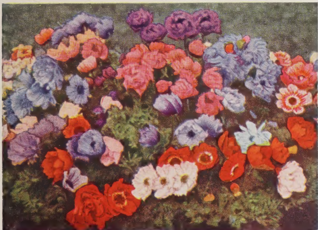
ST. BRIGID ANEMONES

MONARCH DE CAEN. Large single flowers in many colors. 12 for 75c, 100 for $5.50 BLUE POPPY. Deep rich blue single flowers. 12 for 85c, 100 for $6.25 HIS EXCELLENCY. Large single flowers of brilliant scarlet. 12 for 85c, 100 for $6.25 ST. BRIGID. Bright flowers in a wide range of colors in single, double and semi-double forms. 12 for 85c, 100 for $6.25